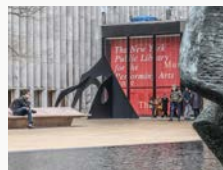
The New York Public Library for the Performing Arts Dorothy and Lewis B. Cullman Center