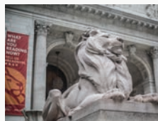
Stephen A. Schwarzman Building