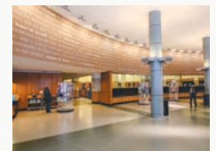
Science, Industry and Business Library