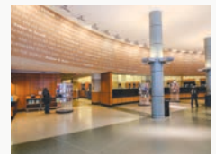
Science, Industry and Business Library