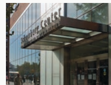
Schomburg Center for Research in Black Culture