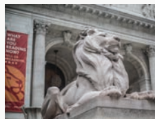
Stephen A. Schwarzman Building