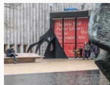
The New York Public Library for the Performing Arts Dorothy and Lewis B. Cullman Center