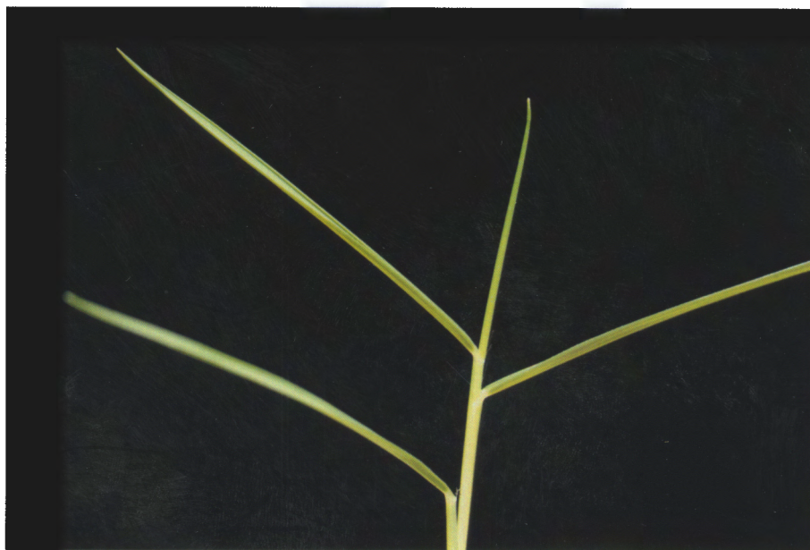
Figure 1. Tiller of 'L1F' zoysiagrass.