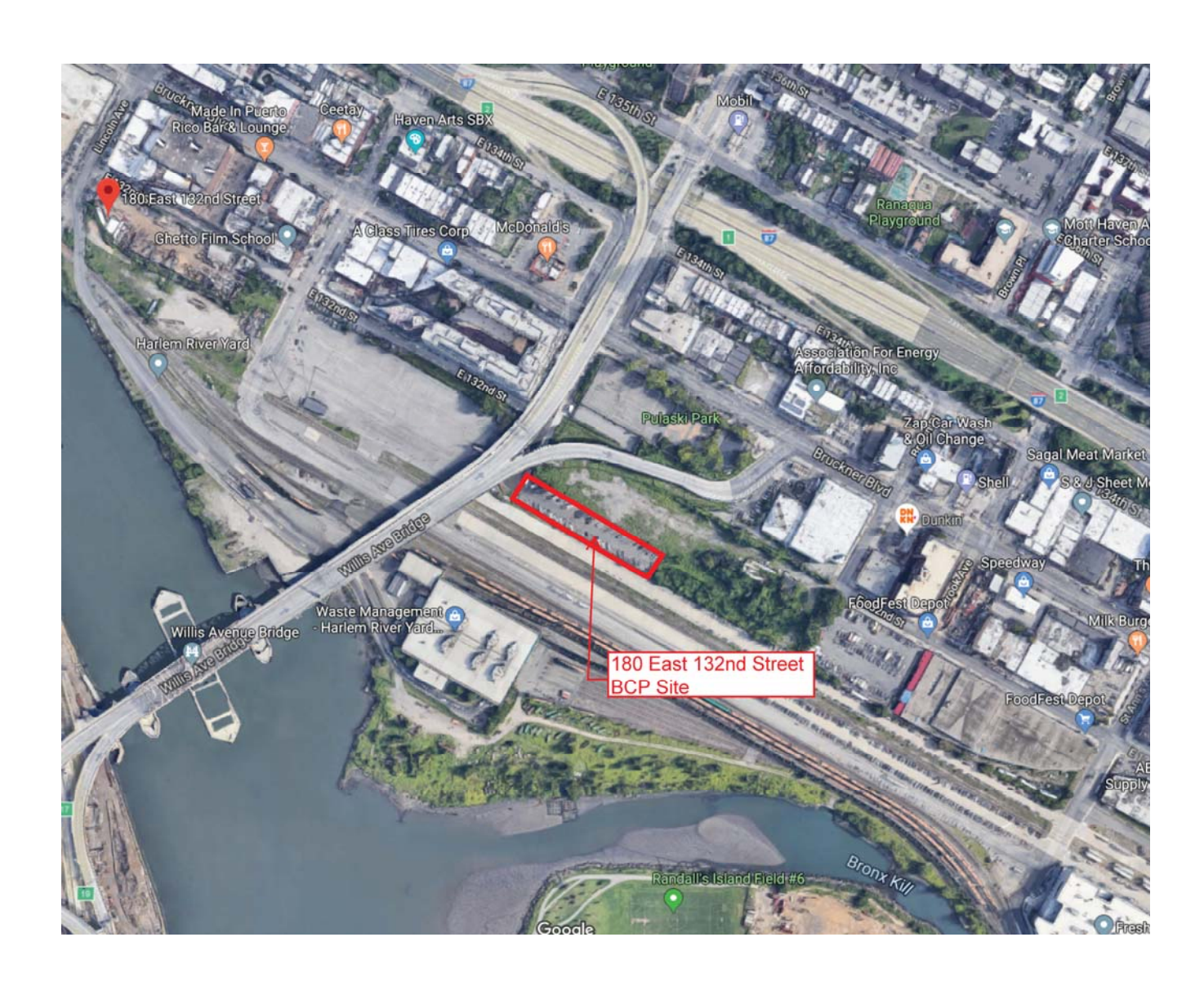
Appendix C - Site Location Map