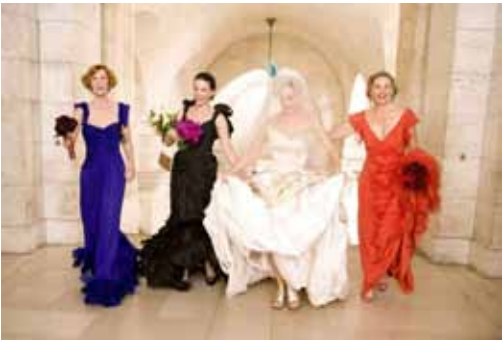
Sex and the City: The Movie .

The Library has entered the popular imagination, with its building, and often its iconic guardian lions, Patience and Fortitude, appearing on countless magazine and book covers, in works of art, advertisements, movies, and television programs. From The New Yorker to Sex and the City , the Library has become imbedded in the idea of the city itself. Referring to the Schwarzman Building, the eminent architectural historian Henry Hope Reed succinctly stated, “One cannot imagine New York without it—its presence is that of some natural fact.”