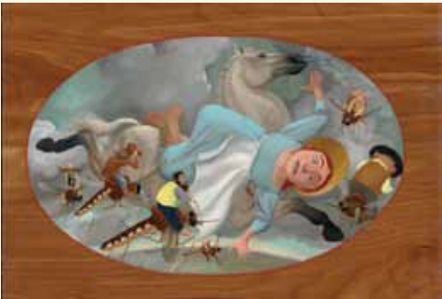
Illustration by Paul O. Zelinsky from Dust Devil by Anne Isaacs. New York: Schwartz & Wade Books, 2010.