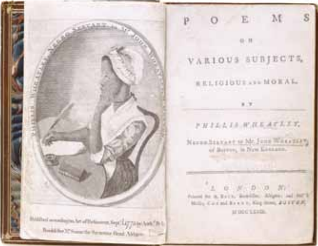
Poems on Various Subjects, Religious and Moral by Phillis Wheatley (London: Archibald Bell, 1773). Schomburg Center; Manuscripts, Archives and Rare Books Division. Digital ID 485600.

Whether focused on a deity, a spiritual force, or the individual soul, the search for something beyond the material realities of daily life has always been one of the hallmarks of humanity. From the Bhagavata Purana , celebrating stories of Krishna, to T. S. Eliot's classic modernist poem The Waste Land , the items displayed here reflect the ceaseless desire for meaning. In their own quests, individuals as varied as Dante Alighieri, Rabindranath Tagore, Virginia Woolf, and Malcolm X have used travel—the journey, the pilgrimage, the search—as a metaphor or organizing principle.