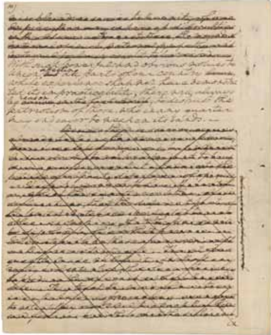
Final draft of George Washington's Farewell Address, Manuscripts and Archives Division. Digital ID psnypl_mss_949.