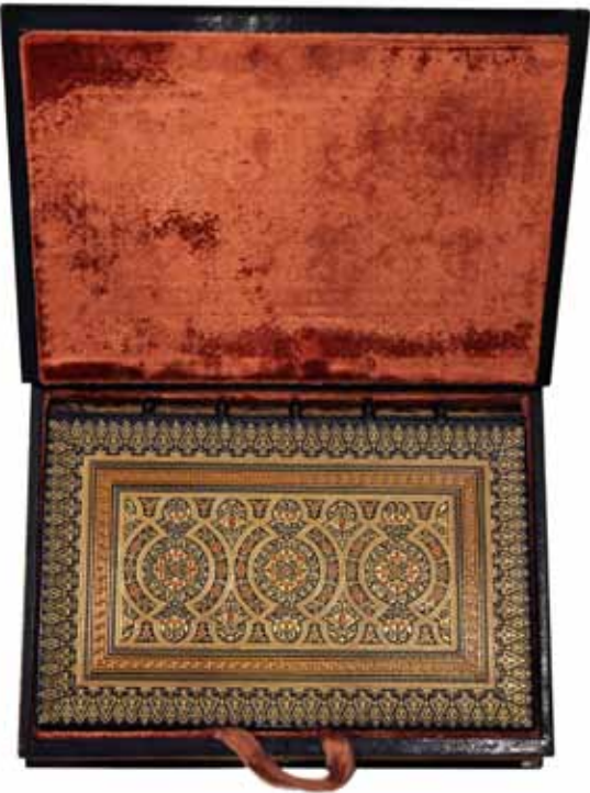
Daphnis et Chloé by Longus, in gilded leather binding and velvet-lined presentation case. Paris: H. Launette et Cie., 1890. Spencer Collection.