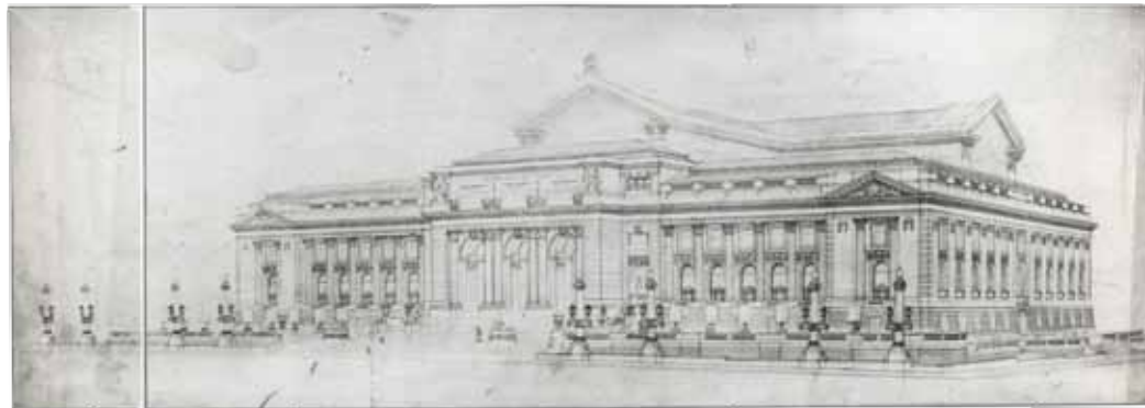
Architectural drawing of the facade of the Library by Carrère and Hastings, ca. 1910. Digital ID 489418.