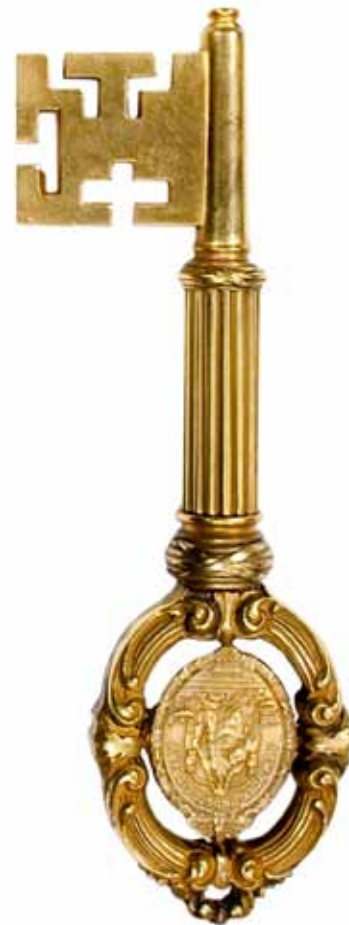
Bronze ceremonial key by Victor David Brenner (New York: Black, Starr & Frost, 1911).

The story of The New York Public Library is a story of ever-widening access to an ever-deepening body of knowledge. The Library was founded in 1895, and when its first director, John Shaw Billings, took the helm he had two simple goals: to continually expand the Library's holdings and to make everything accessible to everybody. Billings's vision was nothing if not ambitious, and dramatically demonstrated NYPL's mission to take its place among the great libraries of the world. An important first step for the new Library was the completion, in 1911, of its central facility—the iconic Fifth Avenue structure, today known as the Stephen A. Schwarzman Building. On opening day, the Library's holdings already comprised more than one million books, and Billings's belief that freedom of information is essential to the health of a democracy had become part of the fabric of the Library itself.