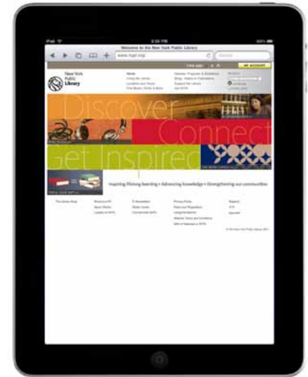
The Library's collections can be accessed online through www.nypl.org .

Over the years, the initial circle of individuals who provided the Library with support, leadership, and curatorial vision has expanded, as has its community of patrons, further reflecting the increasing globalization of the world's most diverse metropolis. And the Library, too, has evolved: Handwritten catalog records and pneumatic tubes have made way for online catalogs and electronic books. The Library's mission, though—to ensure the widest possible access to the greatest number of people—remains the same today as it was a century ago.