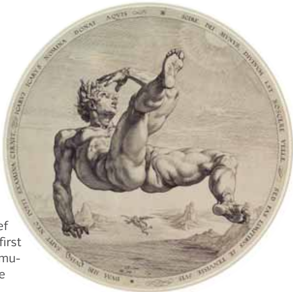
Icarus engraving by Cornelisz van Haarlem, artist; and Hendrik Goltzius, engraver, 1588. Print Collection. Digital ID ps_prn_604.

Alternately analytic, interpretative, and emotional, observations of the natural world are grounded not only in what we see, or think we see, but also in what we know. Ptolemy's 15th-century Geographia , for example, affirms the power of breaking from tradition. While his contemporaries allowed religious belief to influence their work, Ptolemy was the first cartographer to rely on mathematical formulas. Yet his work, too, was incomplete: The “undiscovered” Americas are absent.