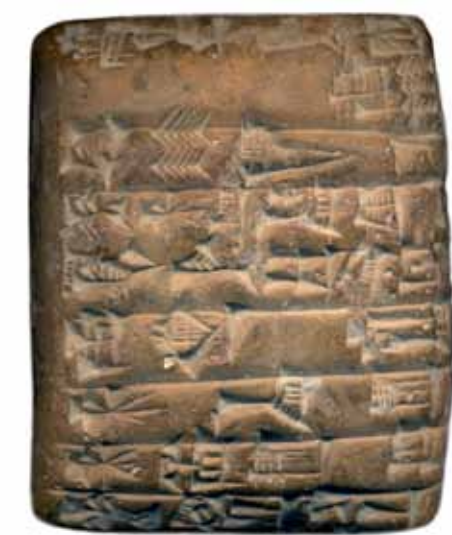
Sumerian cuneiform tablet, ca. 2300 BCE. Manuscripts and Archives Division.

The exhibition has been organized into four thematic sections: Observation, Contemplation, Society, and Creativity. These groupings, drawn from disparate times and places, are meant to highlight the collections' scope and their value as symbols of our collective memory. They also document changes in the way information has been recorded and shared over time, from samples from the Library's collection of Sumerian cuneiform tablets (ca. 2300 BCE) to selections from the Library's 740,000-item Digital Gallery.