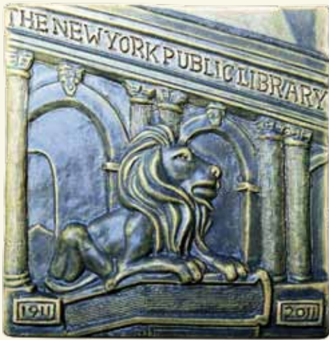
Commemorative tile depicting one of the lions in front of the Schwarzman Building, by New York artist Frank Giorgini. Available in The Library Shop.

Titles marked with an asterisk (*) are available for purchase in The Library Shop.