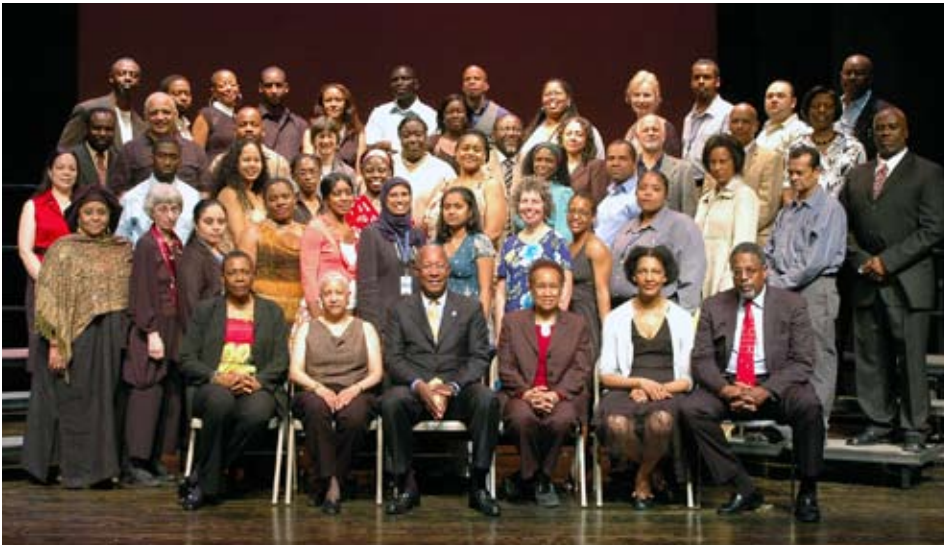
Current Schomburg staff members.

During the Grand Opening Celebrations Schomburg Center staff, volunteers, and alumni gathered to take group photos: