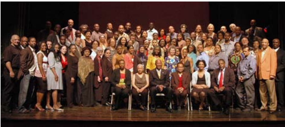
Current and past Schomburg staff members fill the entire stage in the Langston Hughes Auditorium.