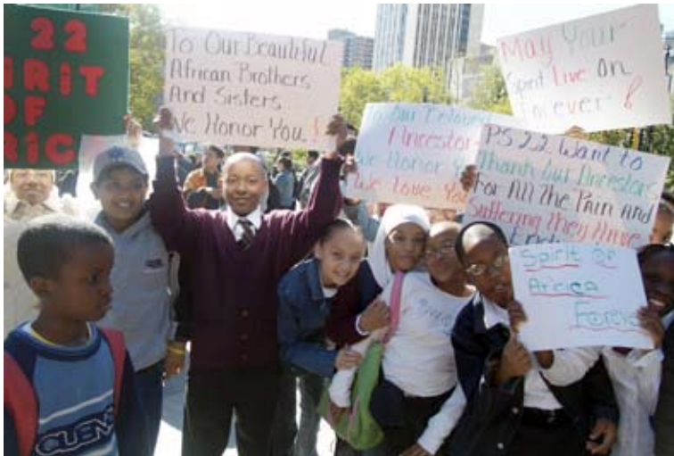
Some of the thousands of schoolchildren participating in the Annual Ring Shout commemoration at the African Burial Ground.