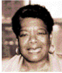
Dr. Maya Angelou

K nowing our legacy—undistorted by others and documented by those who lived it—correctly aligns you and me and our children in the continuing struggle to fully claim our dignity in all areas of life.